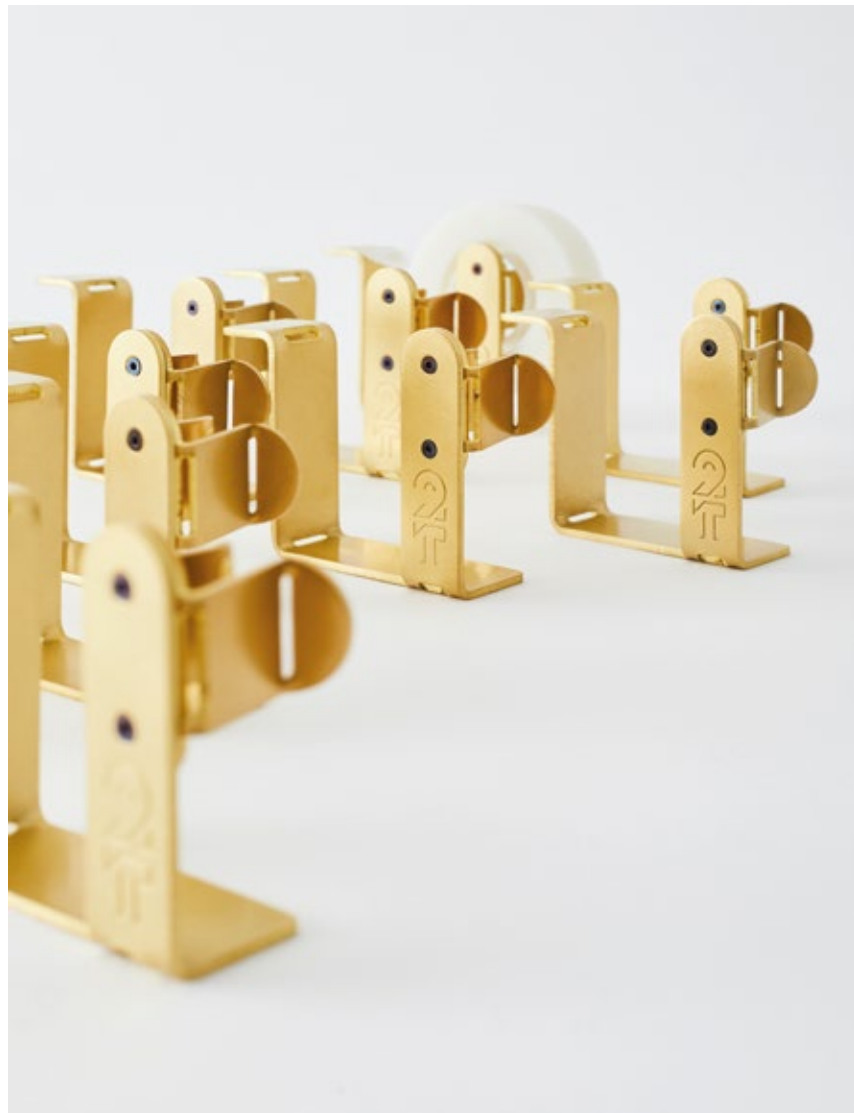
2T-07H Brass, Stainless Steel 80x60x25 mm