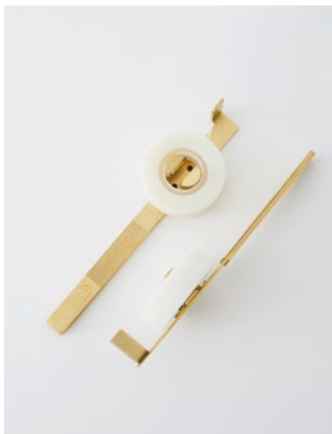
2T-05H Brass, Stainless Steel 30x200x25 mm