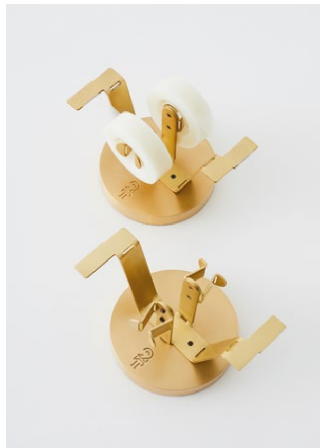
2T-14S Brass, Stainless Steel 100x100x85 mm