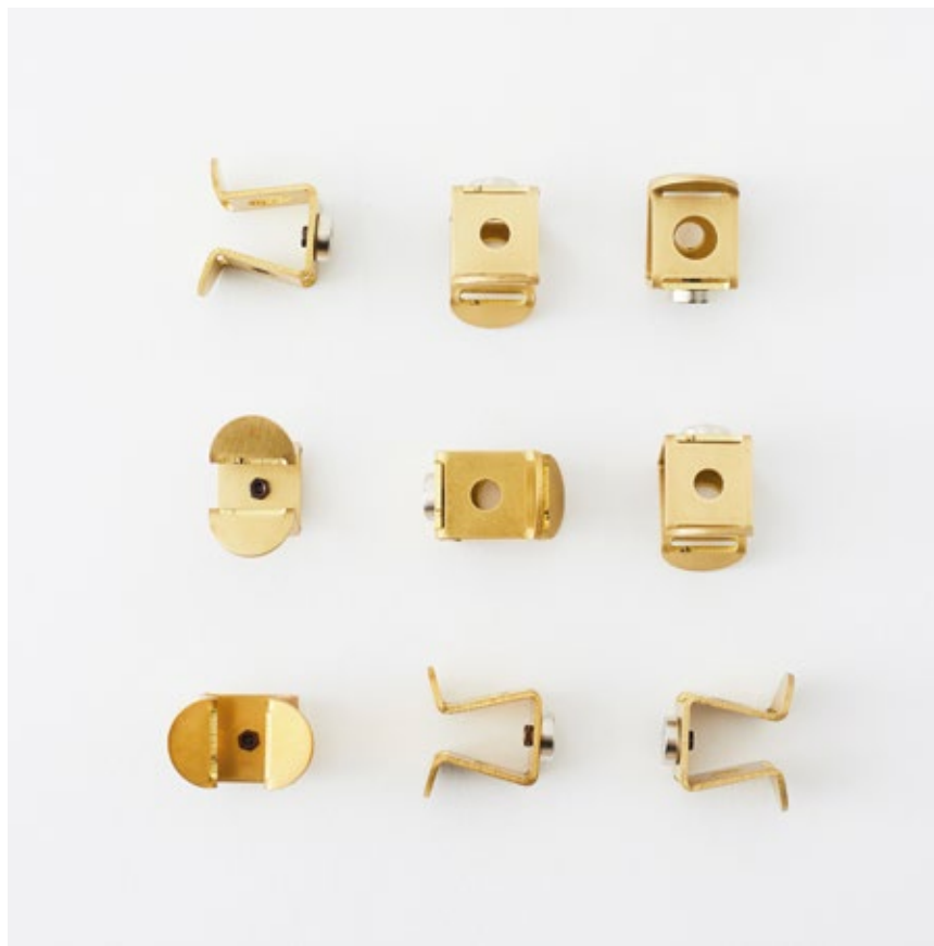
2T-04M x 3 Brass, Stainless Steel, Magnet 30x30x20 mm